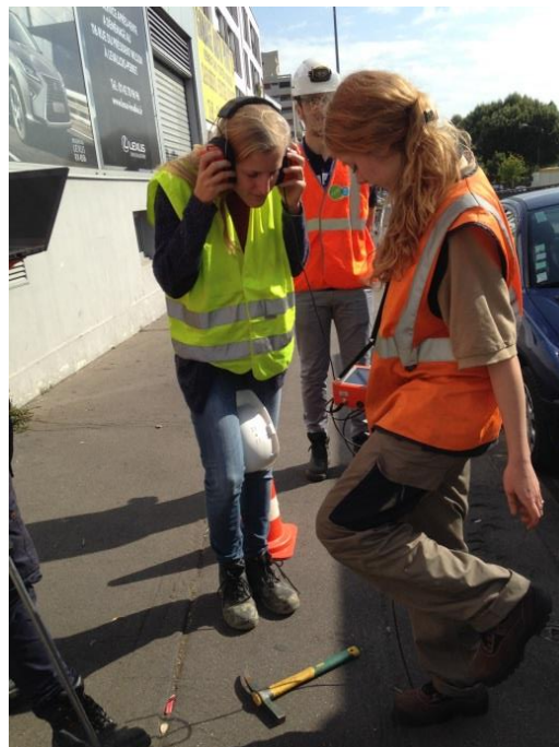
Leak detection field trip